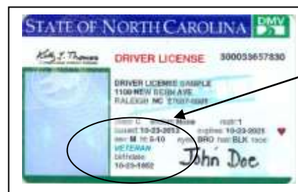
Example of the Permanent Solution